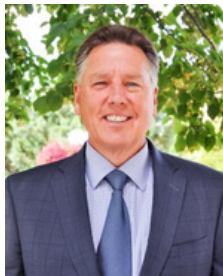
Rock Messerschmidt Foundation Board