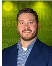
Bob Bartelt Foundation Board