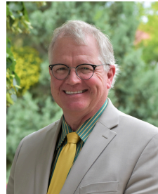
Darren Dunlop Foundation Board